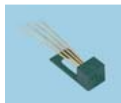
H=6.35, Dia.=6.35, D=15.88 491-573, 491-585