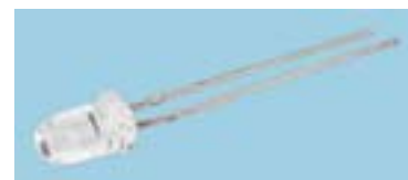
5mm Plastic Case