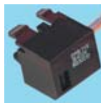
118-2345 H = 12.45, W = 12.7, D = 12.07