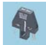
H=23, W=17, D=5 Fixing slot=8.5 3.1