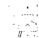
178-944, 120-1181, 176-9741