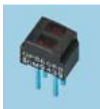
139-830 H=4.5, W=6.1, D=4.40