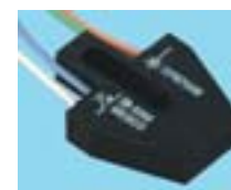
118-2344 H = 15.49, W = 18.03, D = 5.33 Orange Anode Green Cathode White Collector Blue Emitter