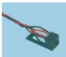
H=6.35, W=6.35, D=15.88, Lead length=305 113-6080