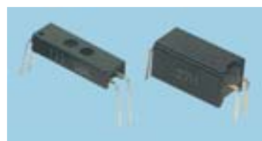
117-3629 H=8.5, W=15 (overall), D=4.2 117-3630 H=8.4, W=15.2 (overall), D=6.2